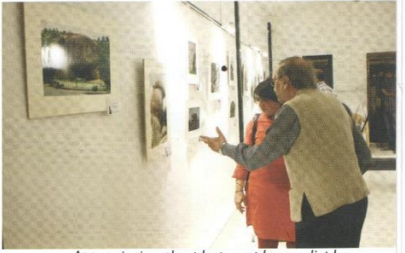
Appreciating the photographs on display